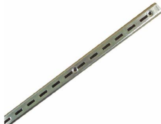
No. 2300 Medium to Heavy-Duty Standards Standards are for heavy-duty applications. These standards are .120" thick (11 gauge) with 1" slots, 1" o.c. for 1" vertical bracket adjustment. Sizes 24" through 144". Finish: Satin Zinc